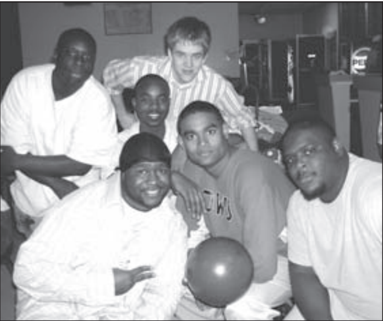
Members of the Willis Intermediate School's Big Brothers/ Big Sisters program at last year's Bowl for Kids' Sake. This year, the event will take place on Friday, March 30.