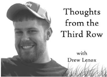
Thoughts from the Third Row