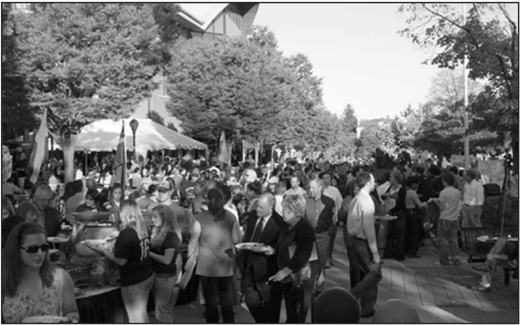
After the inaugural address, Jones led a procession of attendees to the JAYwalk, where tents, tables and a stage transformed the familiar walkway. Food and drink from five different continents were available for the campus and community in a buffet-style setting.