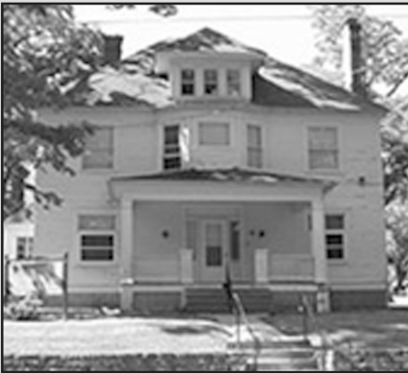
Butler A. Jones House of Black Culture, one of 9 Small Living Units.