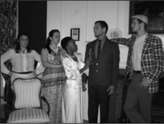
Cast members of “Night Watch.”