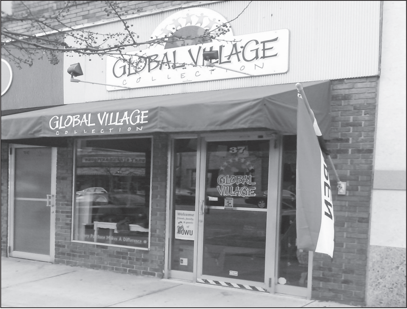
The Global Village Collection, located in downtown Delaware, specializes in selling free trade items which benefit both the consumer and the seller.