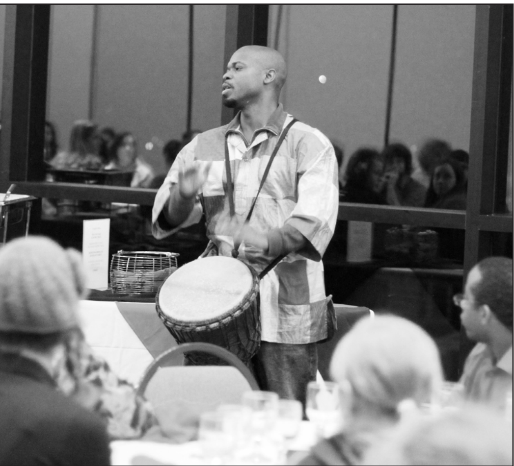
Students were treated to traditional Kenyan music during the Nov. 12 event.