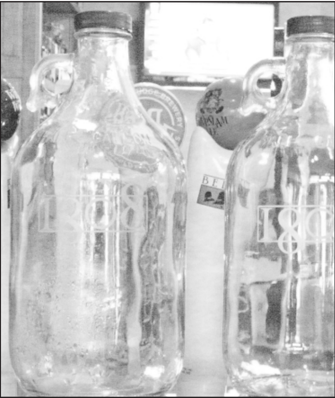
Growlers available for purchase at the restaurant 1808.