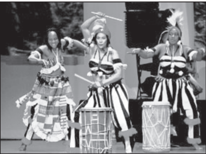
Ohio Wesleyan's Performing Arts Series kicked off the Spring semester with West African themed danced performances on Saturday, Jan. 15.