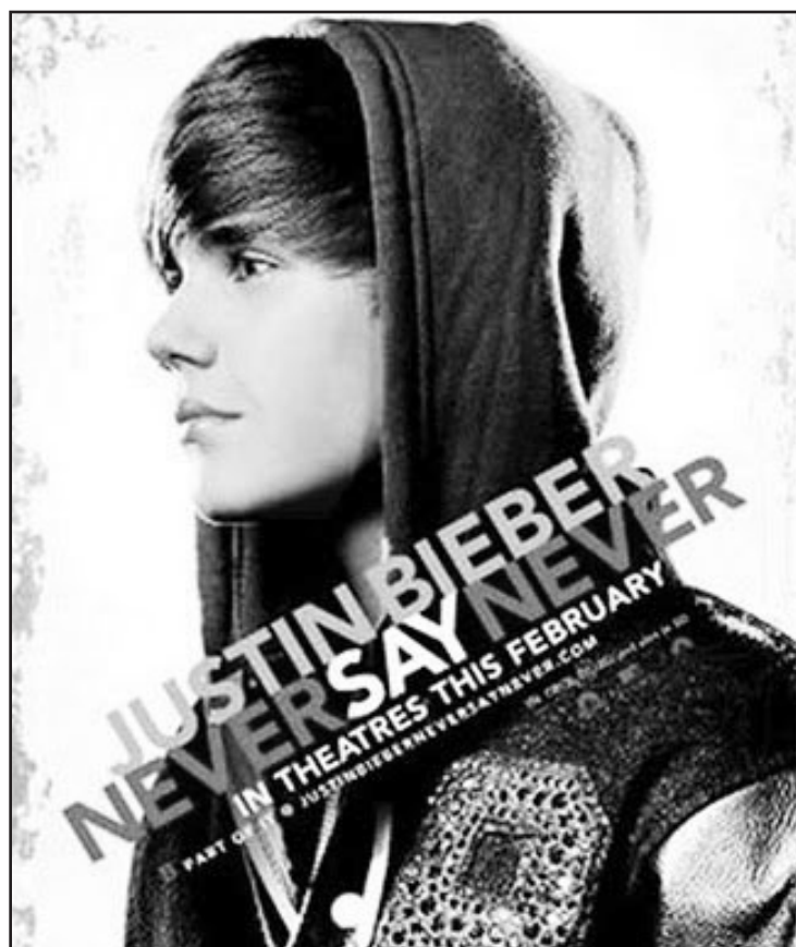
The 'Biebs' has taken over the pop charts and now the silver screen with his documentary, Never Say Never .

In the film, Usher calls Bieber a, "no-brainer" because of his instrumental abilities, vocal stylings, quirky attitude and good looks. While his famous hair swoop is emphasized in the film, it was Bieber's dancing and