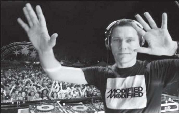
DJ Tiësto will perform in Columbus on Monday, March 28.

Tiësto was ranked best DJ of the year by DJ Magazine for three consecutive years between 2002 and 2004. Currently, he is ranked third best (behind Armin Van Buuren and David Guetta). He was the first DJ to ever play on stage for Olympic Games at the