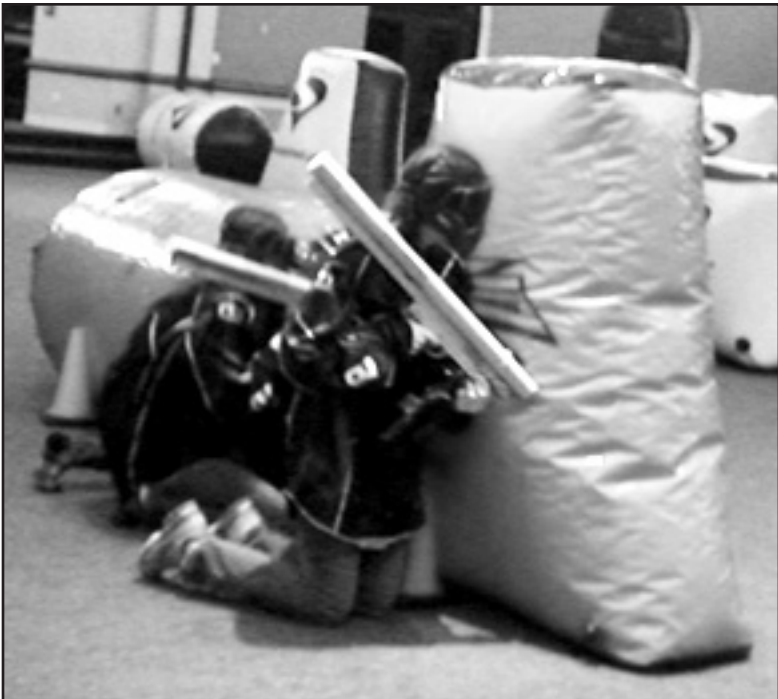
Students playing Bongo Ball during an all-girl match. Bongo Ball is a game where you try to “eliminate” the opposing team by firing air-powered Nerf-missiles at them. The game is played with blow-up obstacles for an increased challenge.