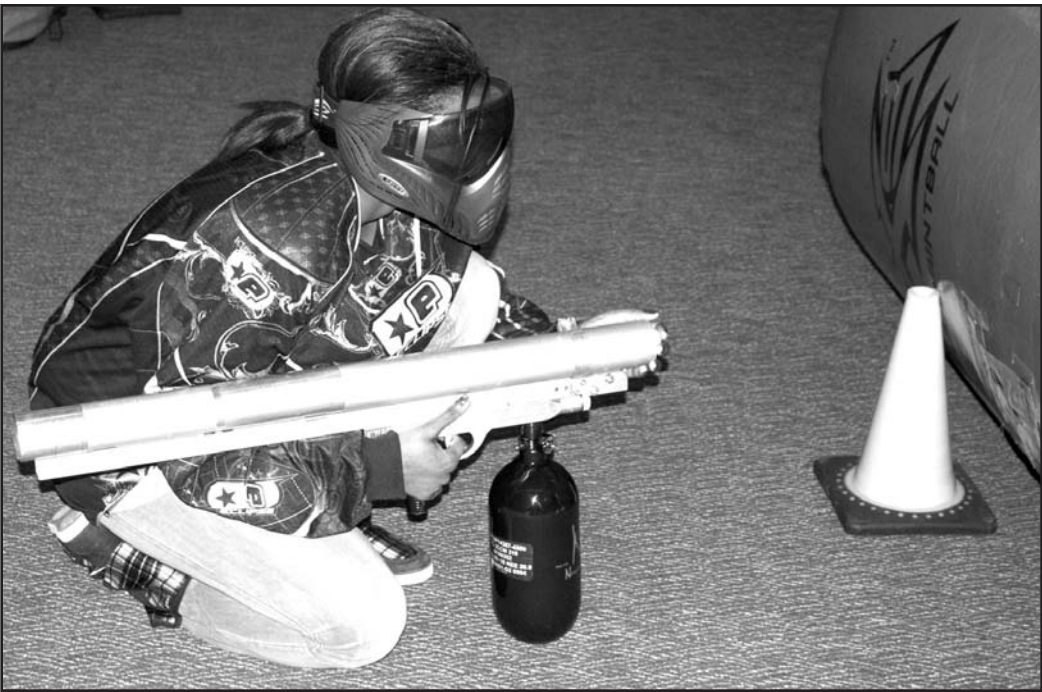
(Above) During a game of bongo ball, a student hides behind a blow-up obstacle to strategize and avoid being hit by her opponents.