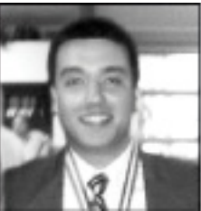
Green Scene By John Romano Guest Columnist

Last week in Green Scene we examined Ohio Wesleyan’s water footprint and determined there is plenty of room for progress to be made in reducing our water consumption as a community. But how exactly do we do this and where are the “low-hanging fruit” for us to pick, so to speak? Consider this: the average American consumes over 170 gallons of water a day, of which around 100 gallons is consumed at home. This means an average of almost 30 billion gallons of water is used each day and over 11 trillion gallons of water consumed each year in the United States through domestic use alone. Next, it is important to examine our water use patterns to see how much water we use each day. It is estimated almost 50 percent of all water consumed domestically is used in the bathroom. For your typical college student, this percentage represents close to 90 percent of your av-