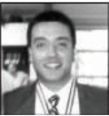
Green Scene By John Romano Guest Columnist

Last week in Green Scene we discussed the importance of being self-conscious and aware of our own consumption habits and the role it can play in reducing our natural resource consumption. One of the most environmentally conscious habits any one of us can adopt is recycling. By simply improving our recycling rate by 10 percent, a conservative and modest amount, the amount of greenhouse gas reduction would be the equivalent of taking nearly 7 million cars off the road each year. By recycling more often, all of us can do our part in reducing our collective energy consumption, conserving vital natural resources around the globe and protecting public health by reducing our “landfill footprint.” We often hear about the importance of recycling, but why exactly is it important to recycle? For starters, it reduces the amount of trash that goes into our landfills. It is estimated recycling 1 ton of plastic saves 7.4 cubic yards of landfill space. Also, while most plastics are biodegradable, they can take between 100 to 1,000 years to biodegrade depending on the type of plastic. In addition, recycling prevents manufacturers from having to use “virgin” natural resources in the manufacturing process. This requires more energy, labor and time than utilizing