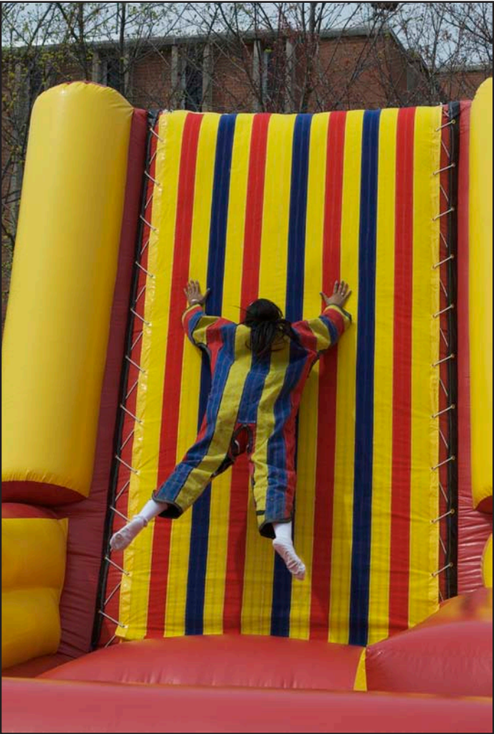
Students were able to wear a Velcro suit and stick to a giant inflatable wall during this year's Day on the JAY.