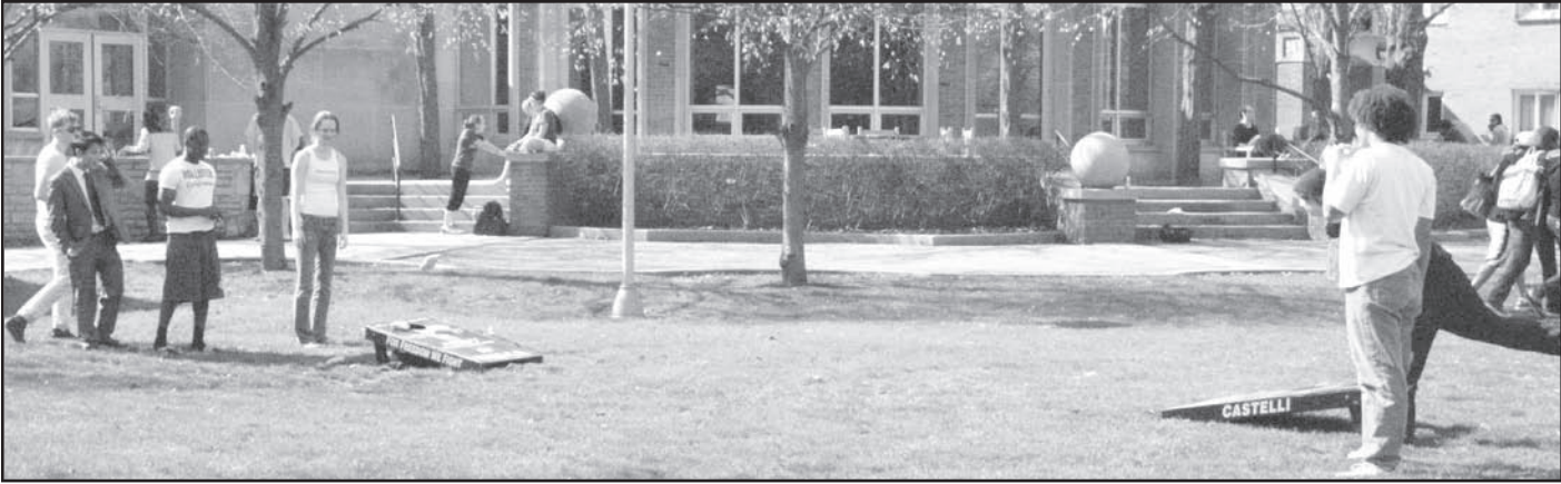
ABOVE: Students play corn hole on Welch lawn during the Thomson picnic. BELOW: Students relax in the nice weather during Student Appreciation Day outside of Thomson. The event is sponsored annually by Thomson store employees.