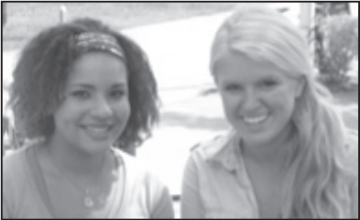
From the Catwalk to the JAYWalk