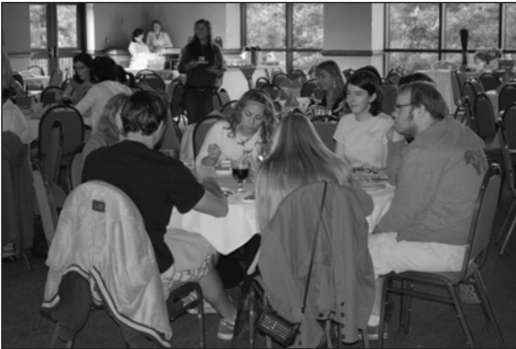
Students and members of the community shared a meal during EarthDance