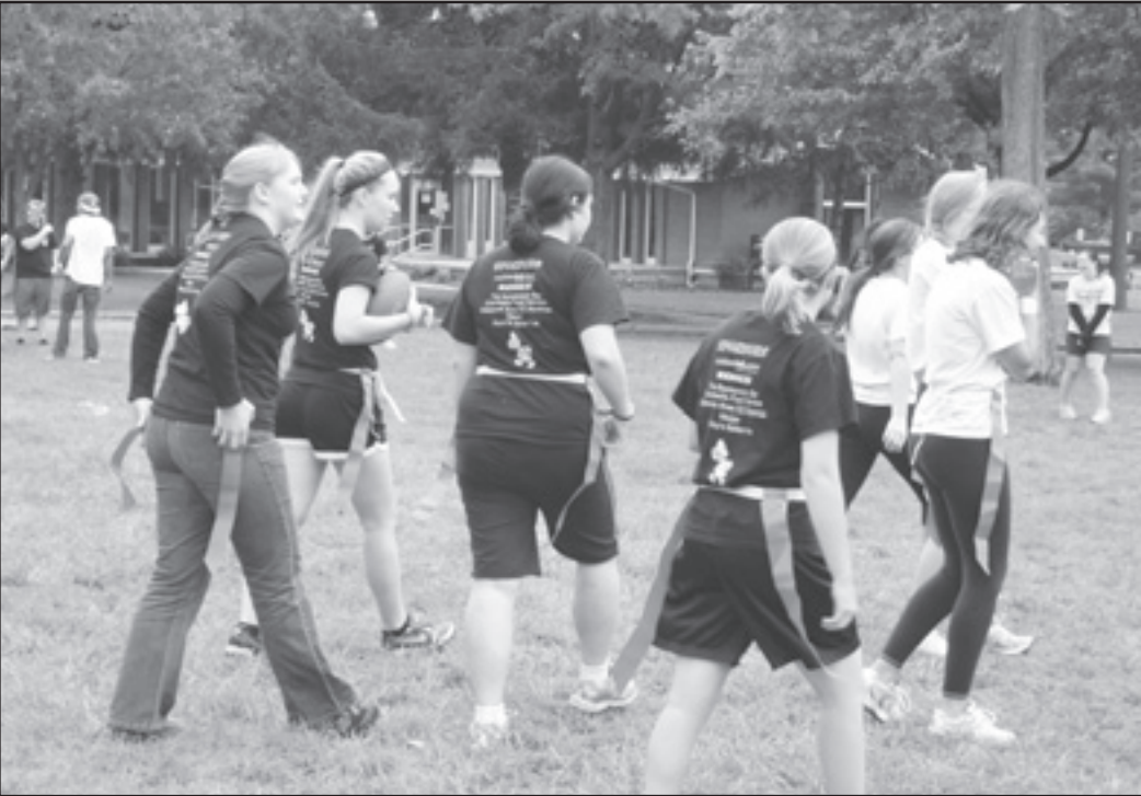
Left: Phi Delt attempts to score on Phi Psi during last Saturday's flag football tournament for charity; Above: Participants warm up with teammates on the sidelines while watching the game in progress; Middle Left: Theta prepares to play DZ during their stint in the tournament; Bottom Left: Anchor Bowl begins with a game between Phi Psi and Phi Delt; Bottom Right: Sig Ep warms up with Phi Delt before their game begins.