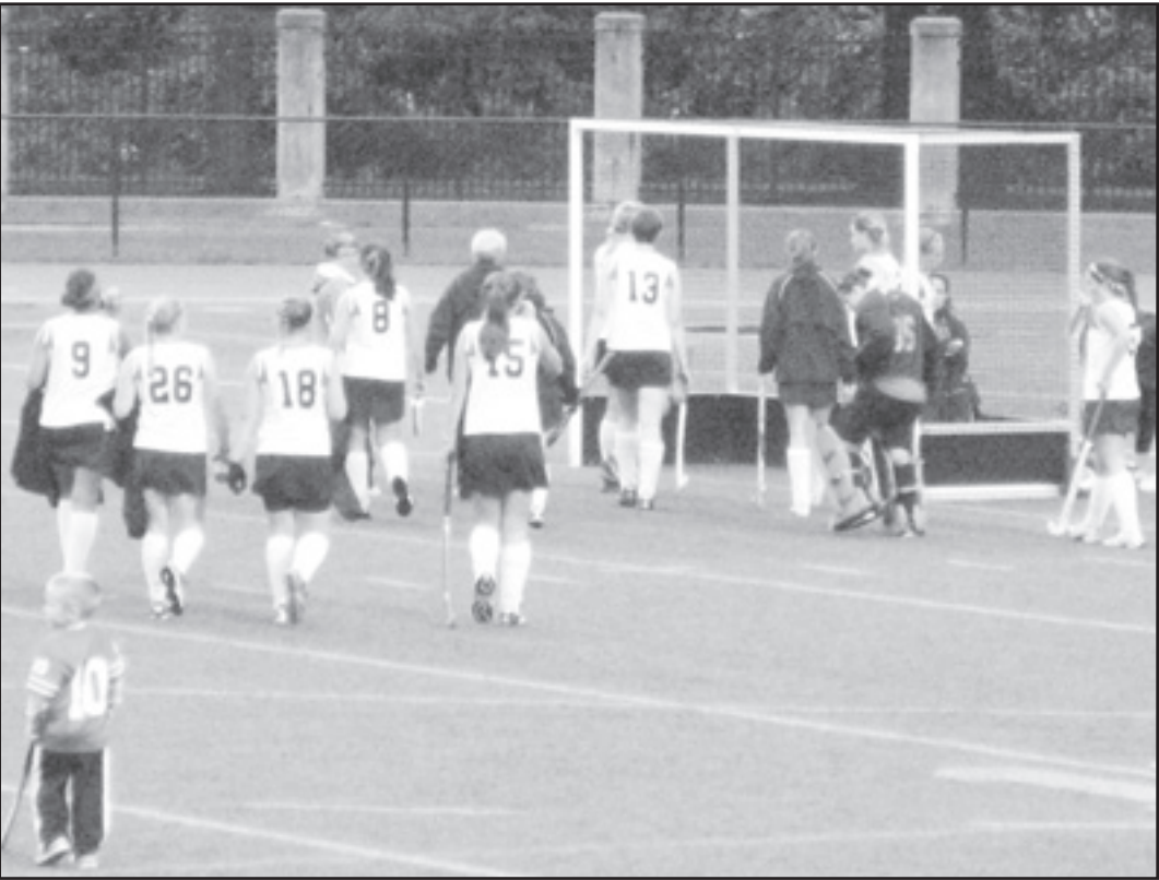
The field hockey team walks off after a tough conference loss to Denison. The Bishops were defeated 2-0 by Denison, bringing the Bishop’s record to 3-5, 1-4 in the NCAC.