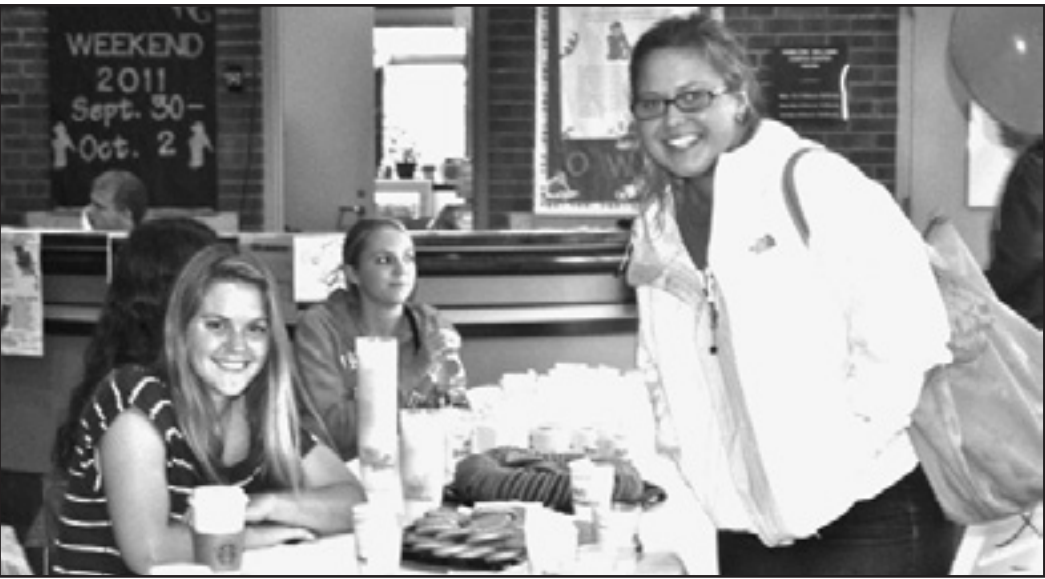
SHO sells cookies in Ham-Will on Monday in preparation for Homecoming week. Homecoming Week is filled with student activities like the one pictured above, and ends with the Dance on the Hill on Friday, Sept. 30.