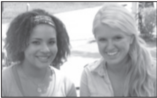
From the Catwalk to the JAYWalk