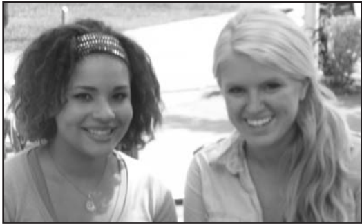
From the Catwalk to the JAYWalk