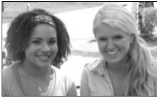
From the Catwalk to the JAYWalk