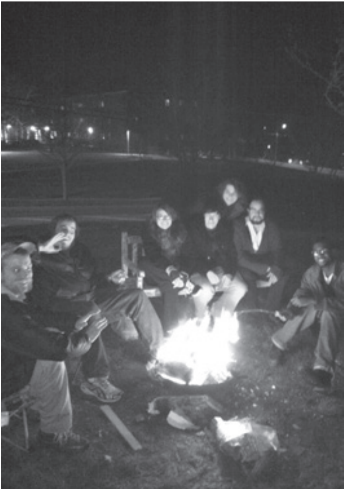
House of Thought members enjoy s’mores and hot cider around the campfire at their SLUSH event on Nov. 30.

WOHO consists of a lot of different majors and personalities. 40 percent of members are greek, representing all so-