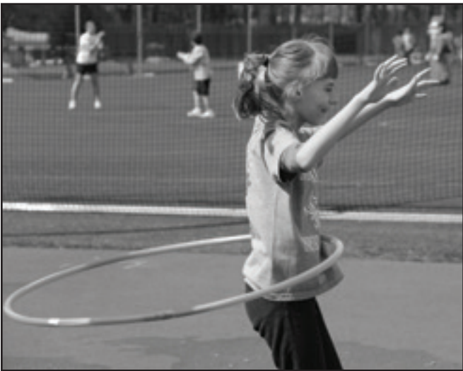
Above: The Bishop and friends kick off the opening of the Bishop Games. Below: A contestant embraces one of her supporters during the game.