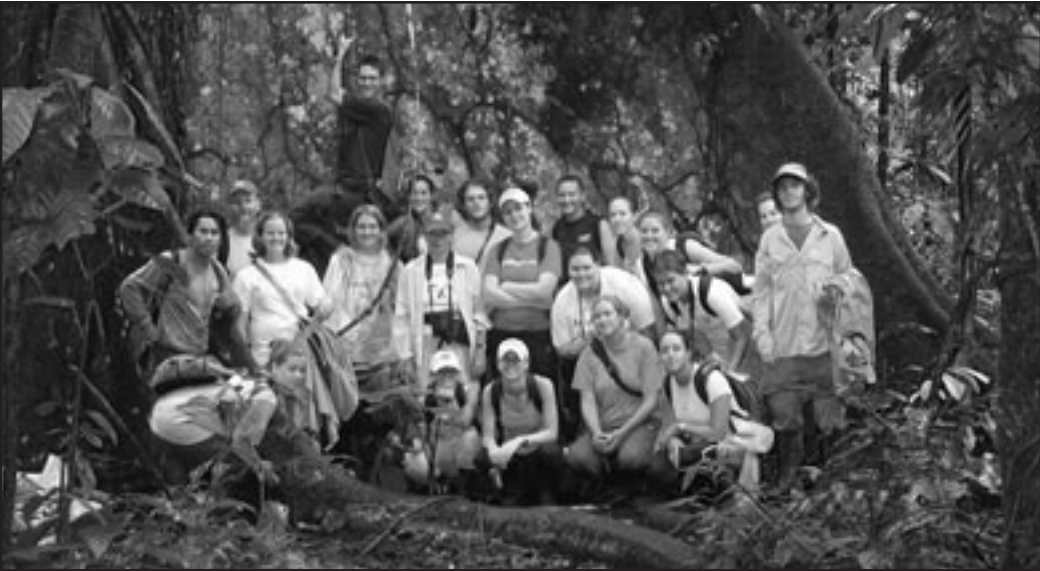
An Island Biology class during a laboratory session in the lowland rainforest of Ecuador.