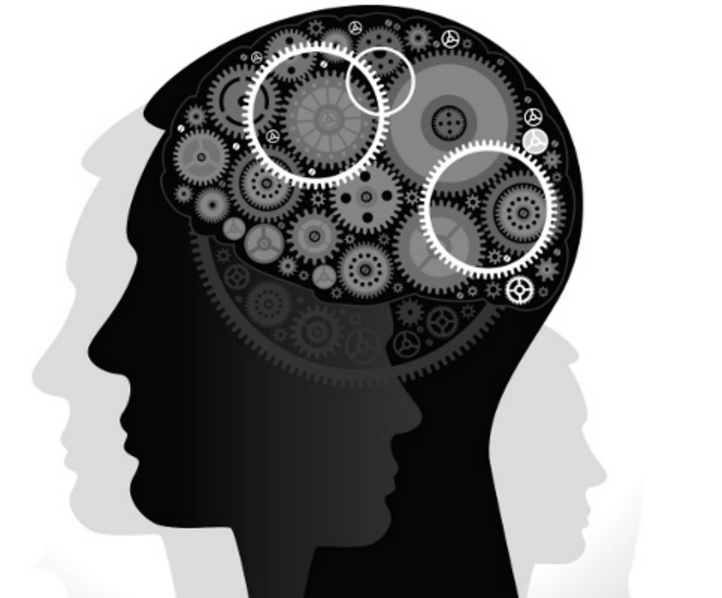
Graphic Courtesy Department of Psychology